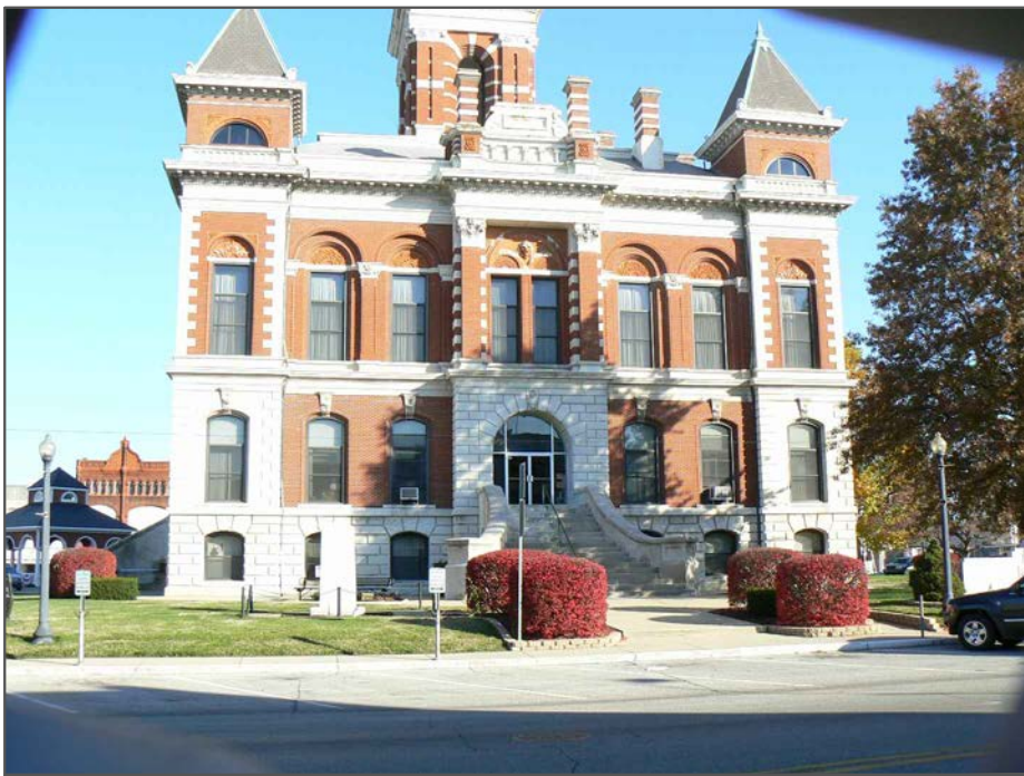
GIBSON COUNTY COURTHOUSE - CIRCA 1884

The Masterplan and corresponding Design Guidelines were created by first surveying existing buildings and conditions, researching historical significance, and analyzing the architectural dominance unique to the downtown area. Overall restoration strategies (utilizing the inherent historic theme, establishing pedestrian orientation, and a thorough downtown redevelopment and cleanup campaign) were developed to reestablish the downtown as the area's hub of social and economic activity. The intended result of this vision is to recreate and retain the pride, vitality, and distinction of this historic downtown community.