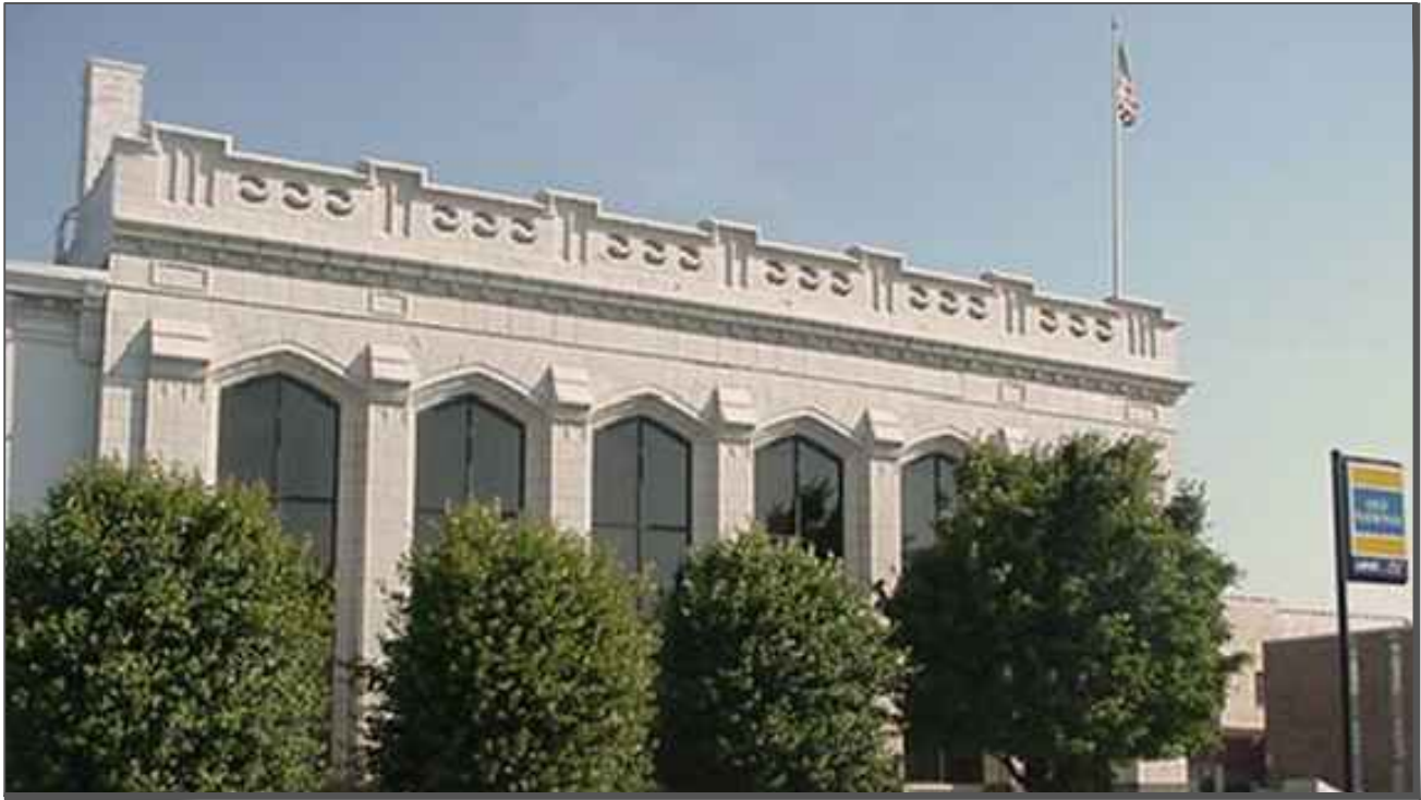
Old National Bank, Mt. Carmel, IL